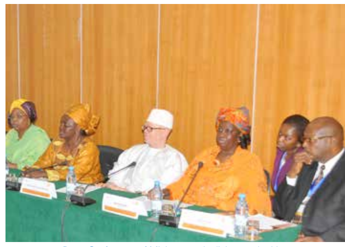
Press Conference of Ministers and religious authorities