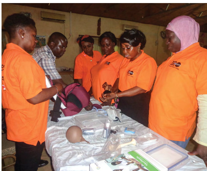
Midwives at the Master and Champions’ training in Bo, learning to help mothers survive and babies breathe after birth.