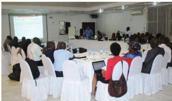
The census results tabulation workshop Wusum Hotel, Makeni, in June, 2016.

The workshop was conducted through a mix of expert presentations on the census questionnaire and codes, expected census database, census products and dissemination plan. Group work and presentations by thematic areas were followed by discussions. The workshop ended with development and adoption of a dissemination plan and tabulation outlines. This will guide the writing of the tabulation program to be used to generate the final results in December 2016.