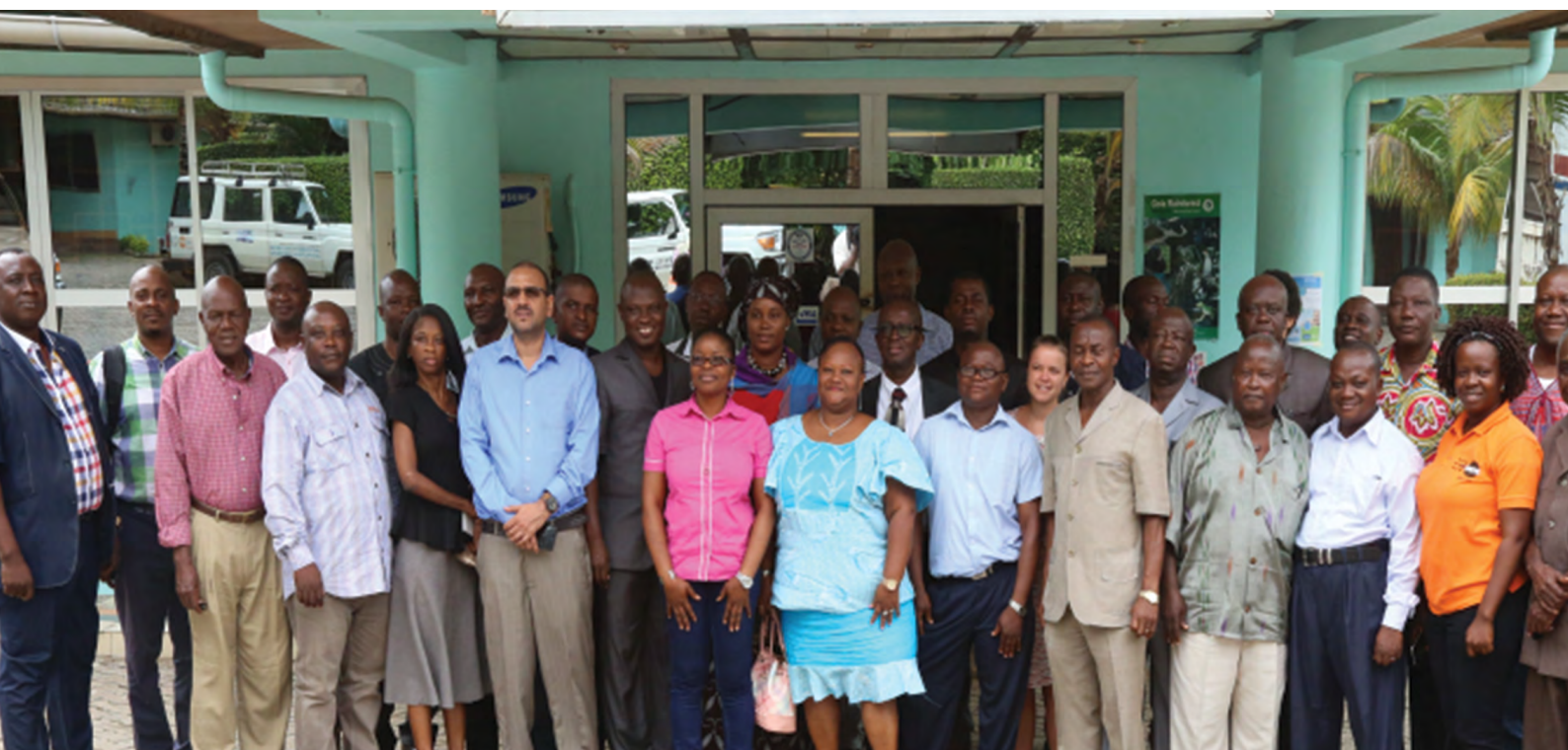
A cross section of participants at the census tabulation workshop.