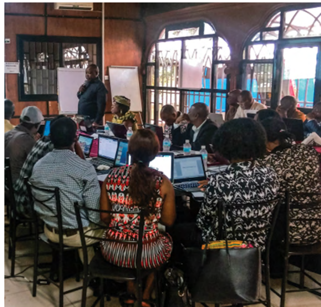
Results-Based Monitoring Training in Bo.