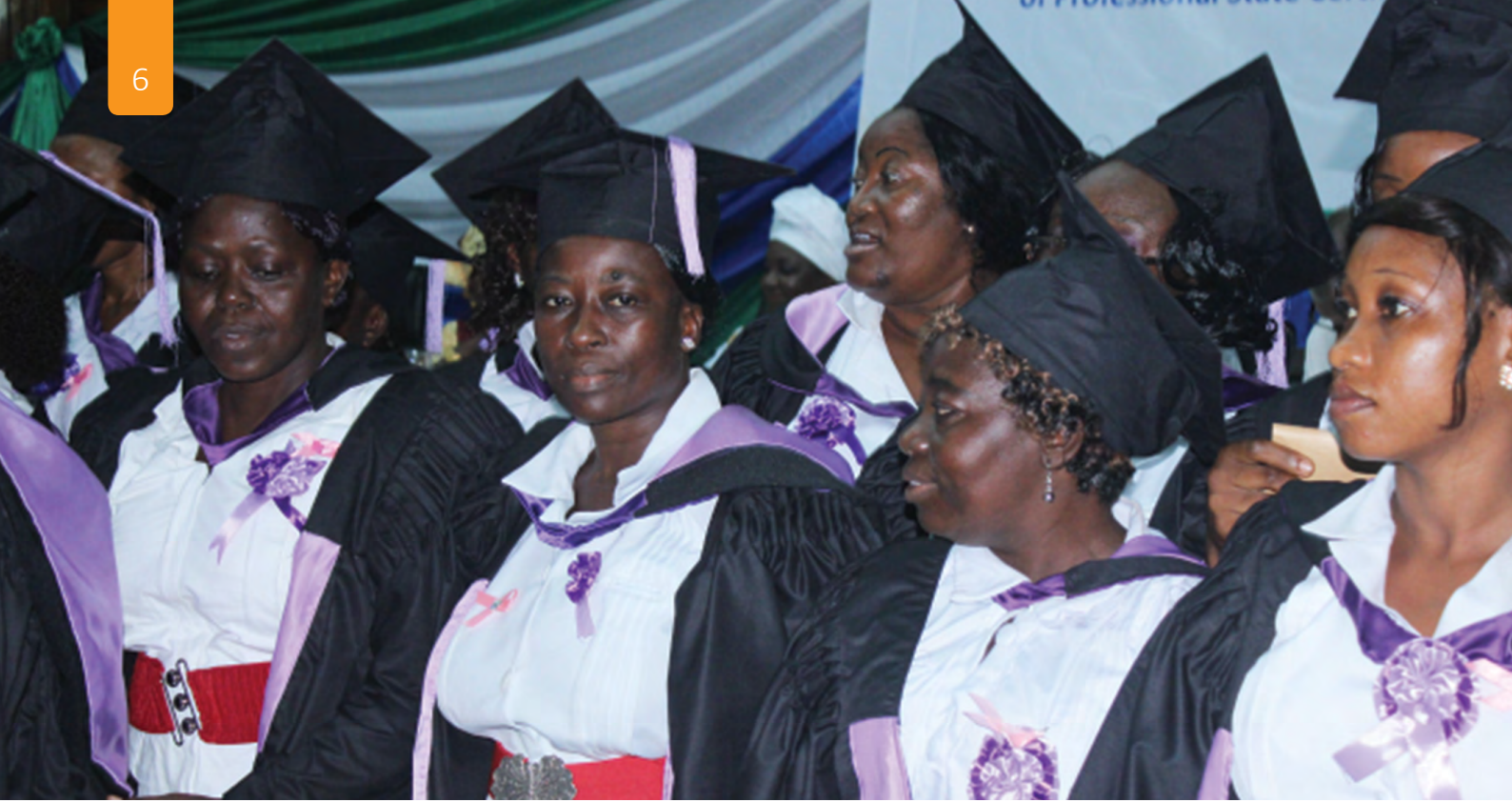
Professional midwifery training graduation ceremony.