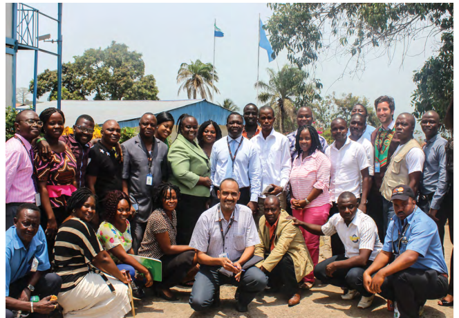
EVD District Contact Tracing Monitors pose with UNFPA staff at the end of their invaluable service to the nation.