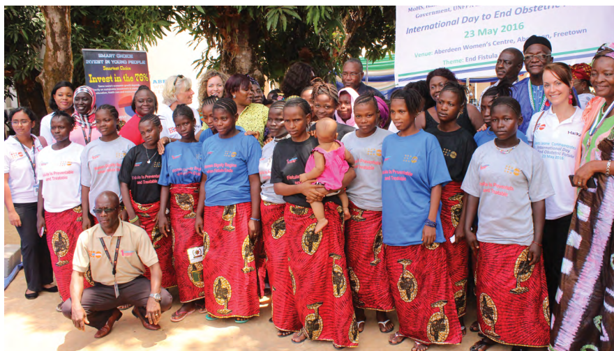
Cross section of patients Commemorating International Day to End Fistula.

“ .. Obstetric fistula is almost exclusively a condition of the poorest, most vulnerable and most marginalized women and girls .. ”