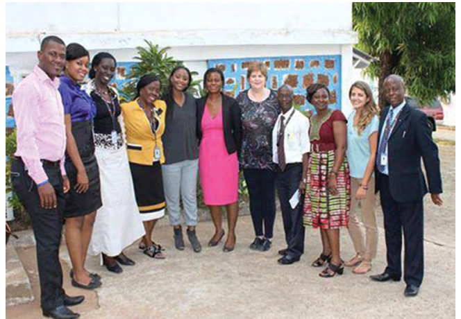
Adolescent, Youth and Gender and Women's Reproductive Health Clusters meet with CNN news anchor Isha Sesay, Founder and President of the Atlanta, USA-based 'Women Everywhere Can Lead', who visited UNFPA in January to discuss girls' and women's empowerment and leadership issues.