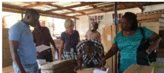
UNFPA and MoHS supply equipment to Port Loko Government Hospital.

In February and March of 2016, with funding from the World Bank, UNFPA, in partnership with the Ministry of Health and Sanitation (MoHS), conducted a two-week competency-based Emergency Obstetric and Neonatal Care (EmONC) training for 121 health personnel in emergency obstetric care in the regional cities of Bo, Kenema and Makeni. The training has contributed significantly to strengthening the capacity of maternity unit staff in newly rehabilitated health facilities, comprising midwives, doctors, community health officers and state enrolled community health nurses.