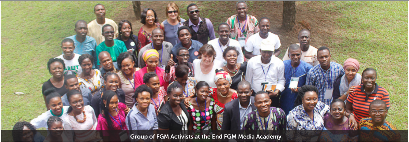
Group of FGM Activists at the End FGM Media Academy