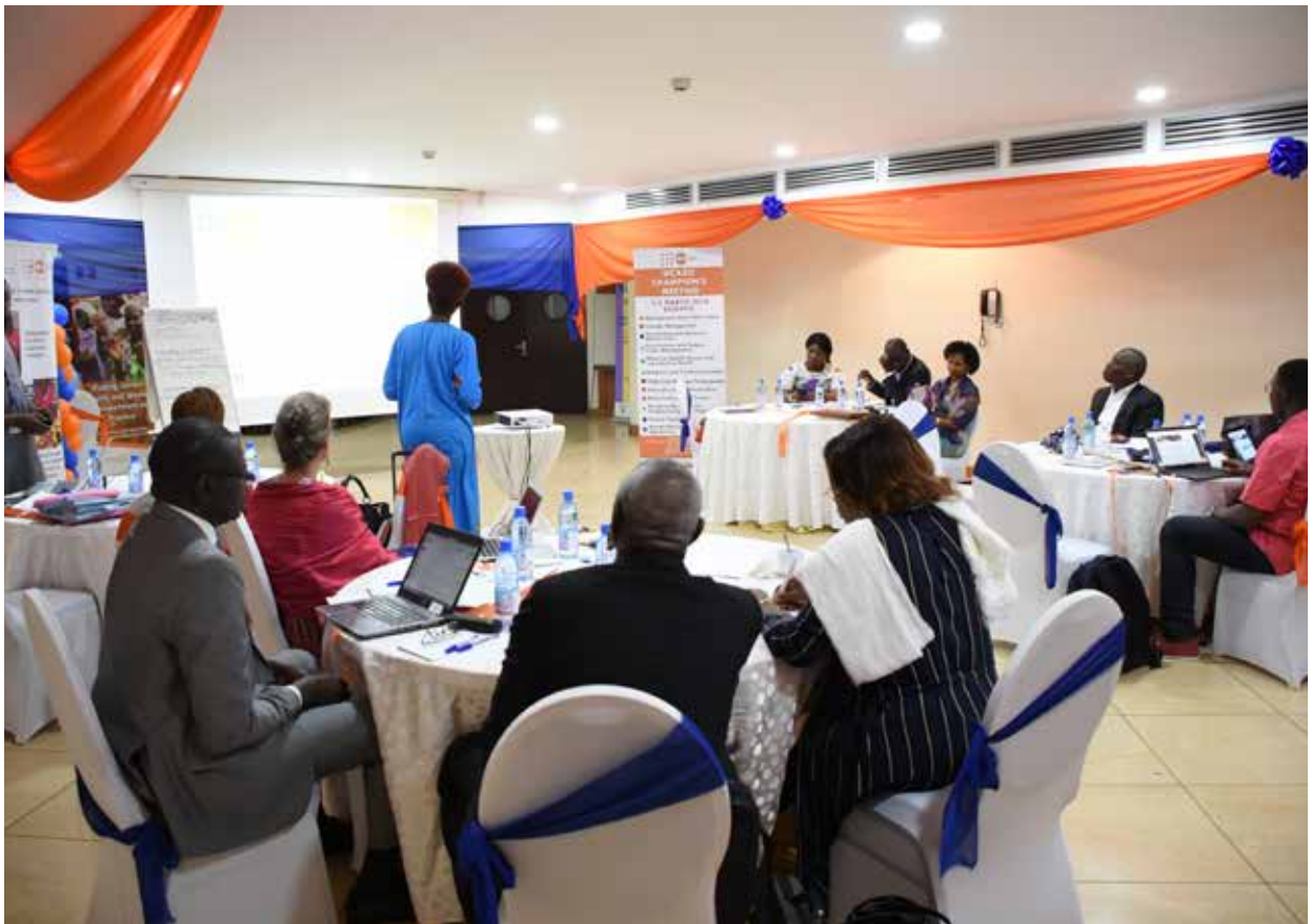
UNFPA - Champions Meeting

UNFPA has a strong comparative advantage in working with civil society and their partners to advance SRHR in challenging contexts and ensure linkages with work to end SGBV and HPs. As a part of efforts to eliminate violence against women and girls and other HPs, UNFPA's WCARO has been highly engaged in strategic partnerships with traditional and religious leaders, FBOs and CSOs, and youth organizations, in order to foster positive social norms, empower women and girls, fight against child marriage and FGM and secure SRHR of all people, particularly women and girls.