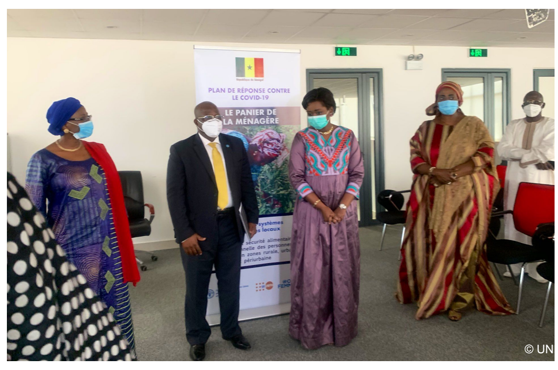
UNFPA, FAO and UN Women are jointly supporting the government of Senegal to respond to COVID-19 by contributing 450 million West African CFA franc to improve food security and resilience of vulnerable families.